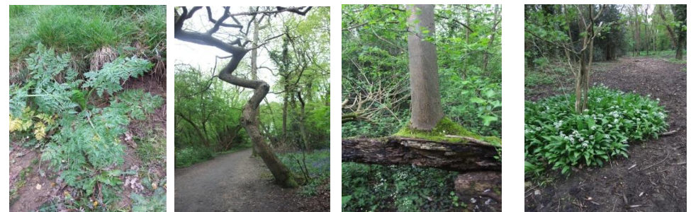
Novelties encountered on April's Bluebell Walk

Other novelties encountered were a sample of hemlock clinging to the edge of an old bunker, the zigzag sweet chestnut tree, two sturdy trunks rising up from a lime tree blown over in the 87's storms and colonies of white garlic mustard flowers adorning the alder and ash trees left behind after clearance for the proposed wetland area. From the humble wood millet to the magnificent oaks we learnt much about the wonders of nature thanks again to our entertaining and knowledgeable guide Nick.