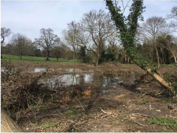
Proposed lake area