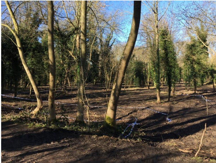
Proposed wetland area