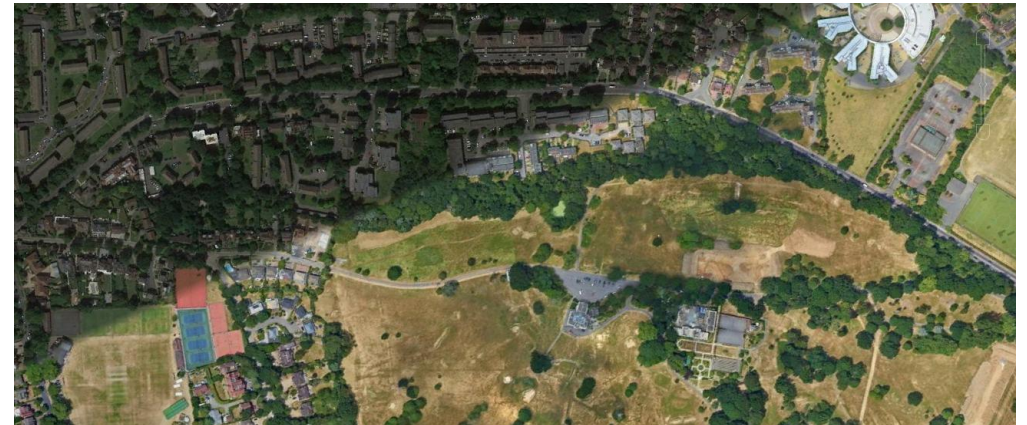
A modern aerial view